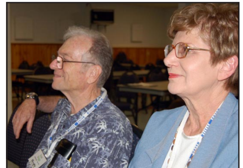
50 years on and they can still smile together.