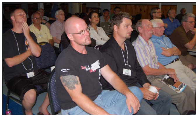
Rapt attention was the dominant factor at this meeting.